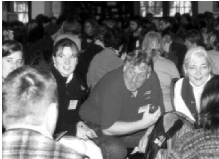
More than 180 people participated in the "Promise of Place" education conference.

Promise of Place attendees left with new activities, resources and networks to build the presence of place in their work, and a powerful sense that there is much more to come.