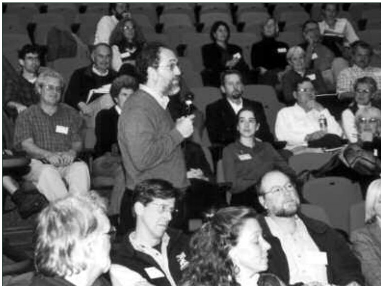
Work team reports results during the Leadership Exchange.

a whole, Exchange participants began to explore and develop the core elements of a new strategic framework that can guide the work of people and organizations across the Northern Forest as we respond to the economic, environmental, and social changes sweeping the region. This framework is built around eight interrelated core strategies ("Regional Strategy"